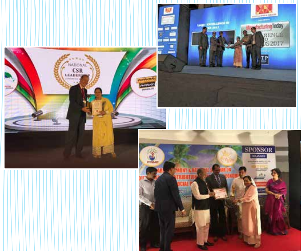
RASHTRA VIBHUSHAN AWARD 2017 FOR "Best Innovative CSR Project"