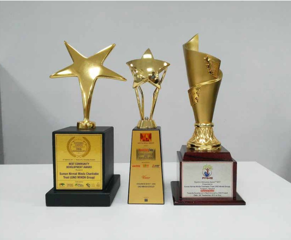
NATIONAL AWARD FOR EXCELLENCE IN CSR & SUSTAINABILITY FOR "Best Community Development"